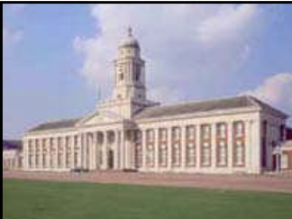
RAF Cranwell, Lincolnshire