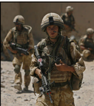
Troops on duty in Afghanistan

The closed week in February was very successful as fiction was recalled from Squirrel Storage and relocated to the basement. This is just a small move to help provide you with a better service. Most fiction published from 1900 is now located in the library. We hope to recall more fiction from Holy Trinity in the future so we have it all under one roof.